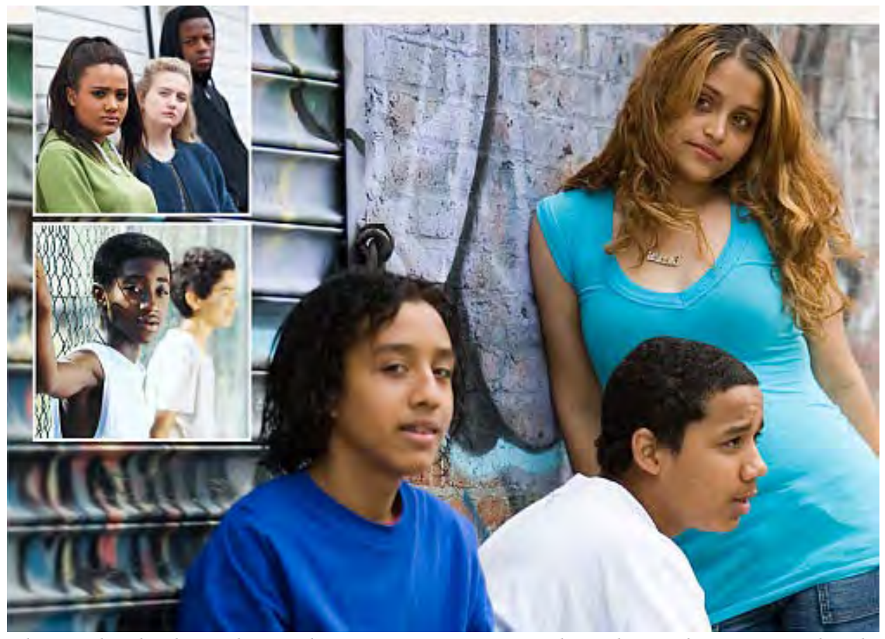
Photo attributed to the Family & Youth Services Bureau - Runaway and Homeless Youth Training & Technical Assistance Center - National Safe Place Network in Louisville, KY, from the 2016 FYSB-RHYTTAC publication contained within this Course 8T, Study Guide 2.

Course 8T - Human Trafficking of Adolescents in America Online CE Course Sponsored by CEU By Net, LLC